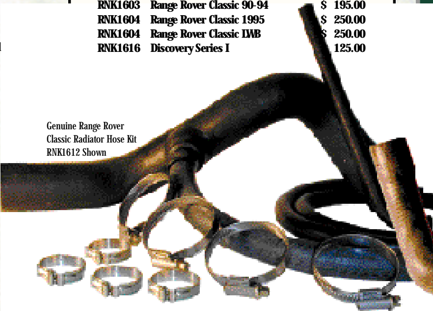
Genuine Range Rover Classic Radiator Hose Kit RNK1612 Shown

Includes: Land Rover Genuine Parts radiator hoses, heater hoses, expansion tank hoses, thermostat, gasket and all necessary clamps. RNK1601 Range Rover Classic 87 and 88 $ 170.00 RNK1602 Range Rover Classic 1989 $ 220.00 RNK1603 Range Rover Classic 90-94 $ 195.00 RNK1604 Range Rover Classic 1995 $ 250.00 RNK1604 Range Rover Classic IWB $ 250.00 RNK1616 Discovery Series I 125.00