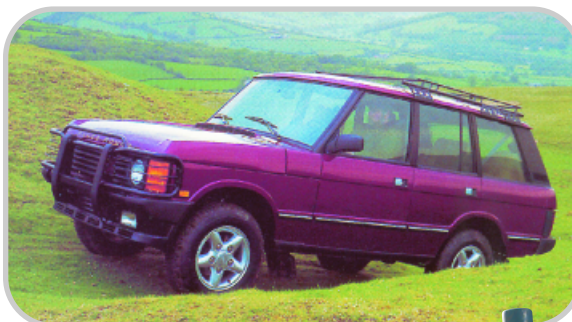
Range Rover Classic shown with "Sports RNW212" wheels.